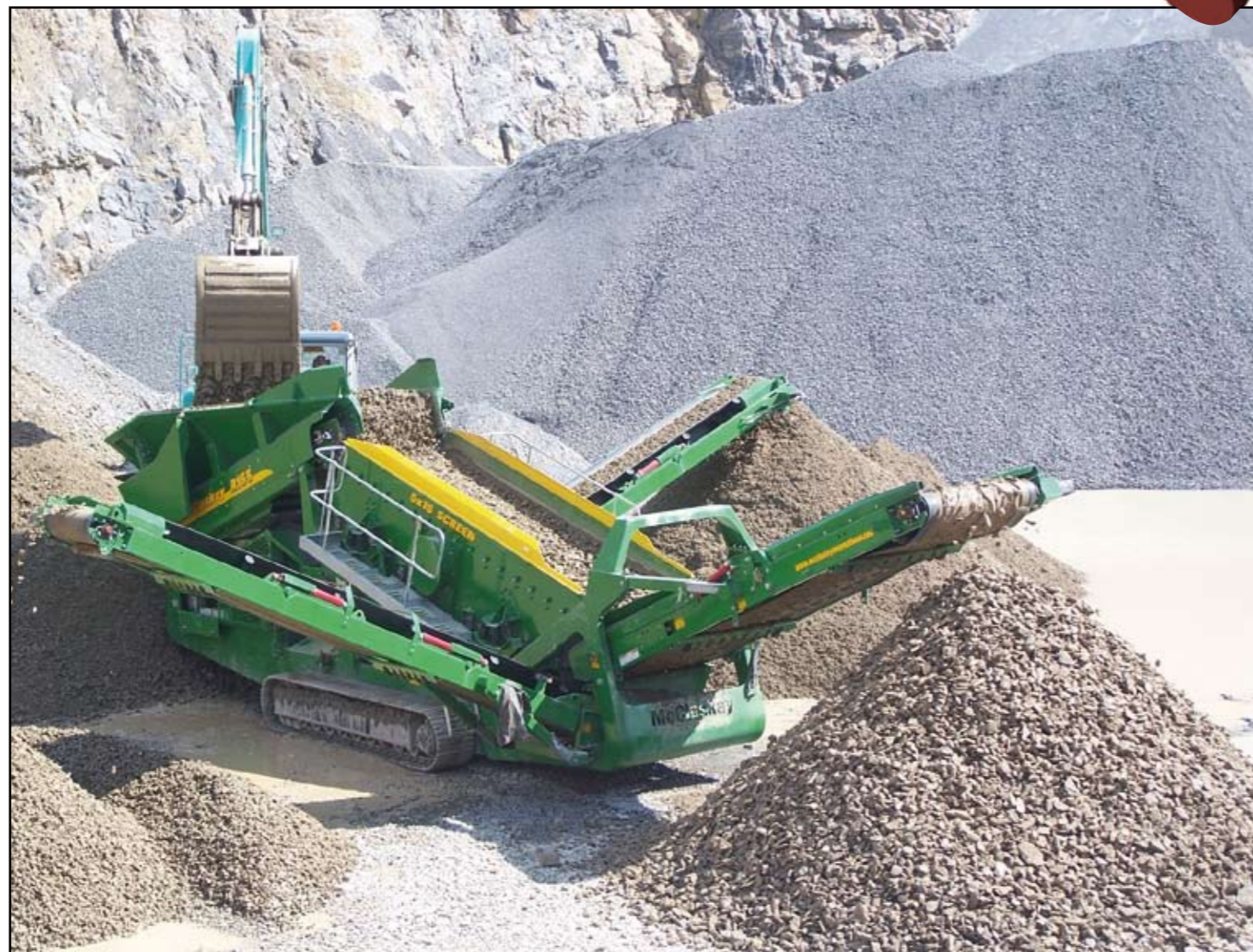
McCloskey's R155 high-energy vibrating screener incorporates the Nimco CV691 and CV791 control valves for optimum performance

One of the key issues when designing a screening machine is to give the end user the ability to accurately set the speed of all the different conveyor belts. This is of great importance because the